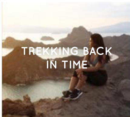
TREKKING BACK IN TIME