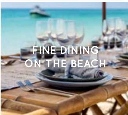
FINE DINING ON THE BEACH