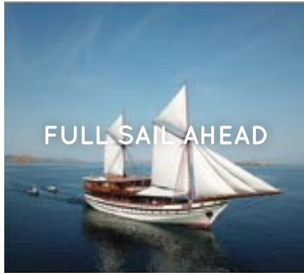
FULL SAIL AHEAD